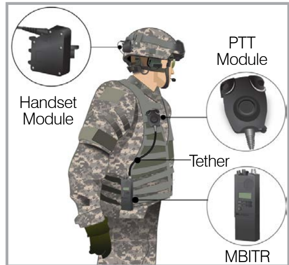
USSOCOM Secure Wireless Headset Program

Software Engineering: design, develop and maintain software information management; management and distribution of information from various sources to many audiences