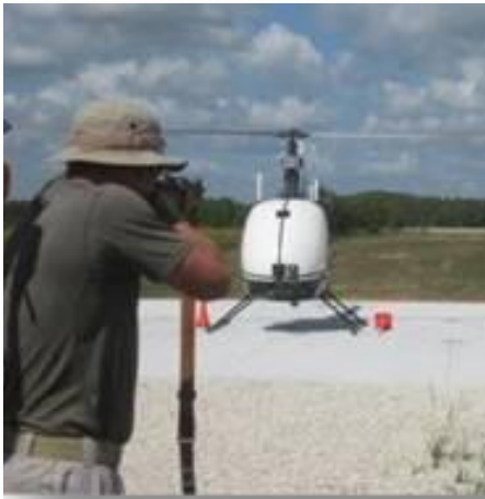
USSOCOM Maverick UAV Test Program

Delivering Client-Focused Solutions that Work