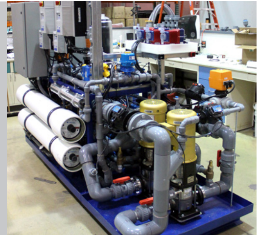
Twin Ultra 10,000 gal/day (38m³/day) skid-mounted, water recycling system