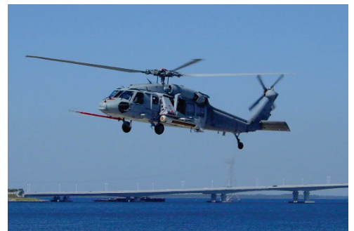
An MH-60S helicopter equipped with CSTRS.